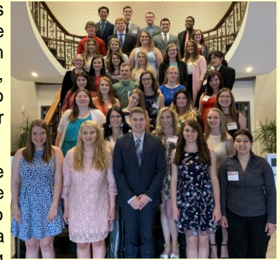
2019 COE participants.

The Midwest Poultry Consortium extends a big thank you to our banquet sponsors: Daybreak Foods; Farmer Automatic of America – Aggero; Henning Companies; Hy-Line NA; Life-Science Innovations; Maple Leaf Farms; Naturally Recycled Proteins; Purina Animal Nutrition; Rose Acre Farms; Sonstegard Foods; and Sparboe Farms for making the COE “Casino-Nite” Banquet such a success. Thank you sponsors!