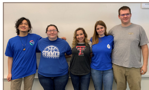
2019 COE/Purdue students speaking at the poultry club meeting.