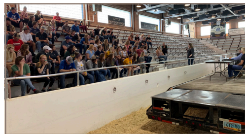
NDSU Annual Poultry Panel Networking Event.