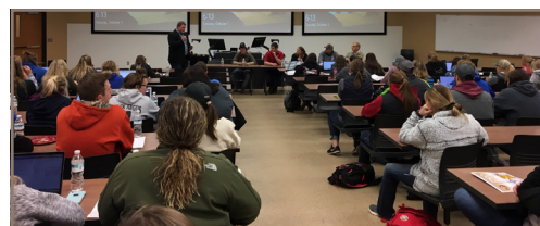
SDSU Annual Poultry Panel Networking Event.